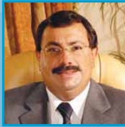
Dr. Tarek Kamel Minister of Communications and Information Technology

Dr. Tarek Kamel was Senior Advisor to the Minister of Communications and Information Technology for five years before himself being appointed Minister. During this time he spearheaded a number of national initiatives to spread the use of ICT tools amongst segments of Egyptian society. Currently, the Minister is known for his visionary strategy to drive Public Private Partnership initiatives to develop Egypt's ICT sector, leading Egypt into the global Information Society.