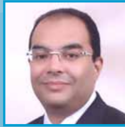
Dr. Mahmoud Mohieldin Minister of Investment The Arab Republic of Egypt

Dr. Mohieldin is the Minister of Investment of the Arab Republic of Egypt since 2004. The Ministry of Investment is responsible for the investment policy; the management of state-owned assets including privatization and restructuring of public enterprises, and joint ventures; and the non-banking financial services including capital market, insurance, and mortgage finance.